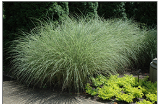
Morning Light Maiden Grass