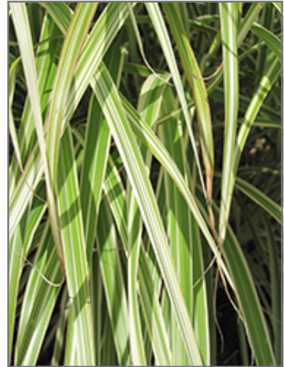
Morning Light Maiden Grass foliage

This plant does best in full sun to partial shade. It prefers to grow in average to moist conditions, and shouldn't be allowed to dry out. It may require supplemental watering during periods of drought or extended heat. It is not particular as to soil type or pH. It is highly tolerant of urban pollution and will even thrive in inner city environments. This is a selected variety of a species not originally from North America. It can be propagated by division; however, as a cultivated variety, be aware that it may be subject to certain restrictions or prohibitions on propagation.