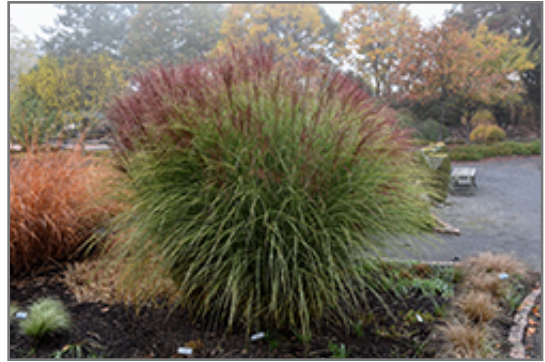
Morning Light Maiden Grass fruit

Morning Light Maiden Grass is recommended for the following landscape applications;