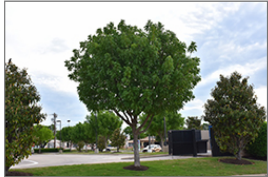
Chinese Pistache