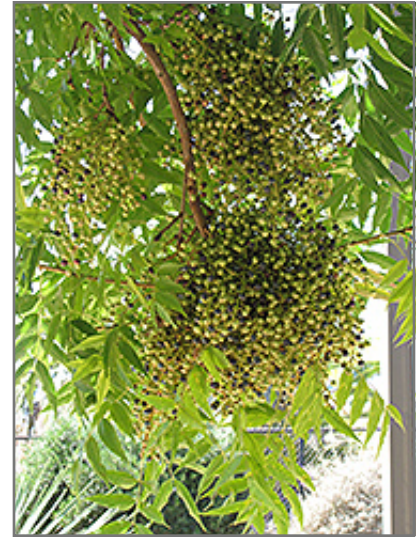
Chinese Pistache fruit

This tree should only be grown in full sunlight. It is very adaptable to both dry and moist growing conditions, but will not tolerate any standing water. It may require supplemental watering during periods of drought or extended heat. It is not particular as to soil type or pH. It is highly tolerant of urban pollution and will even thrive in inner city environments. This species is not originally from North America.