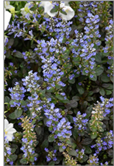
Chocolate Chip Bugleweed flowers

Chocolate Chip Bugleweed is recommended for the following landscape applications;