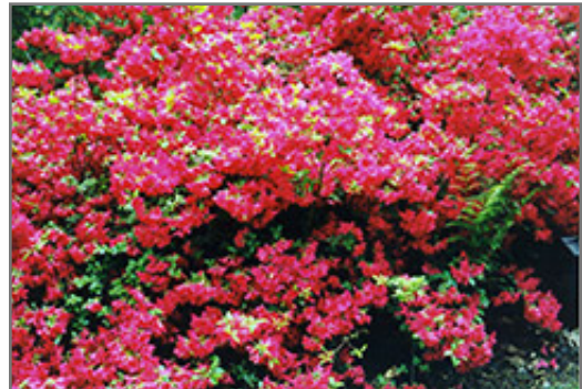
Hino Red Azalea in bloom