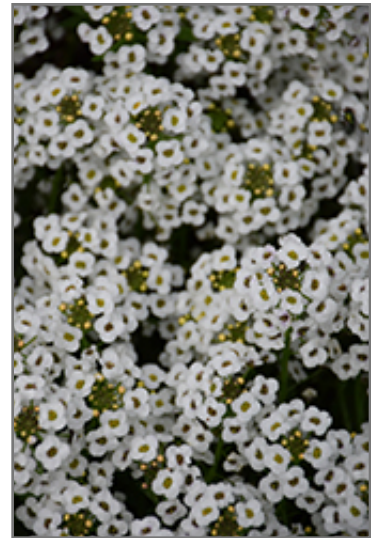
Stream White Sweet Alyssum flowers

Stream White Sweet Alyssum is recommended for the following landscape applications;