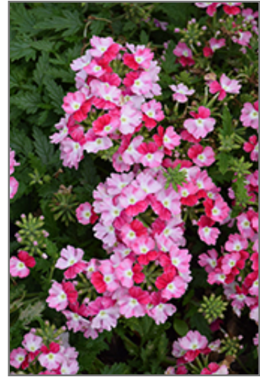
Lanai Twister Red Verbena flowers

Lanai Twister Red Verbena is recommended for the following landscape applications;