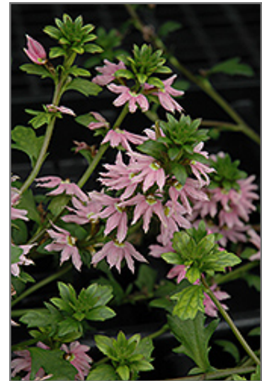
Bombay Pink Fan Flower flowers