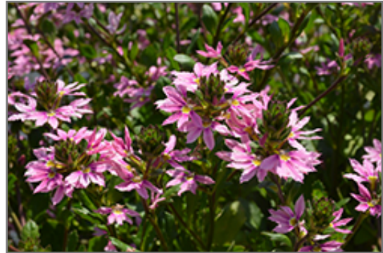
Bombay Pink Fan Flower flowers

Bombay Pink Fan Flower is recommended for the following landscape applications;