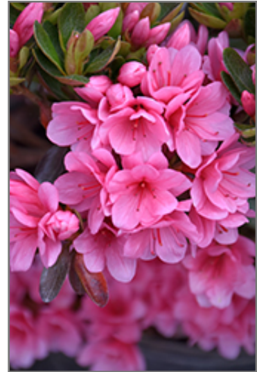
Coral Bells Azalea flowers