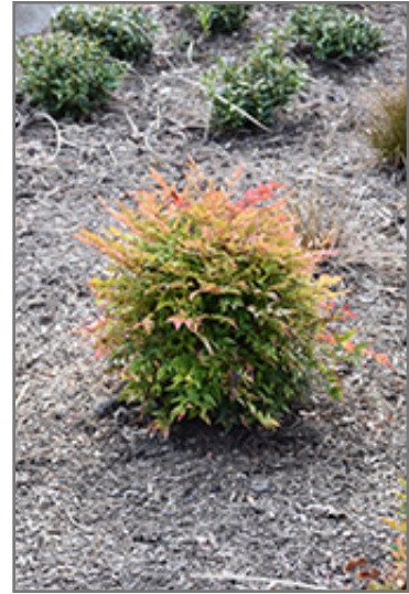
Gulf Stream Dwarf Nandina