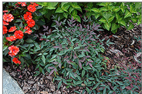
Flirt Nandina