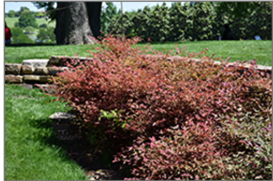
Flirt Nandina

Flirt Nandina is recommended for the following landscape applications;