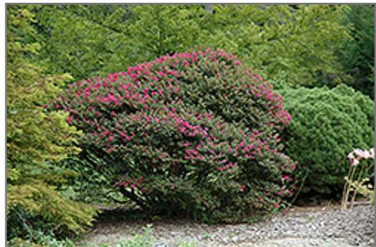
Pocomoke Crapemyrtle in bloom