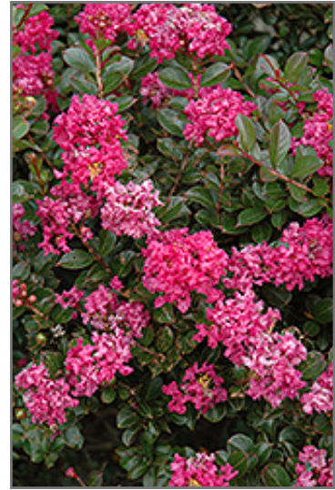
Pocomoke Crapemyrtle flowers

Pocomoke Crapemyrtle is recommended for the following landscape applications;