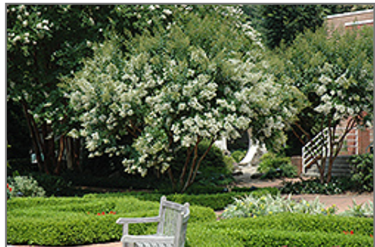
Natchez Crapemyrtle in bloom