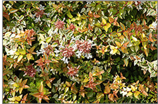
Kaleidoscope Abelia flowers

This shrub will require occasional maintenance and upkeep, and should only be pruned after flowering to avoid removing any of the current season's flowers. It is a good choice for attracting birds, bees and butterflies to your yard, but is not particularly attractive to deer who tend to leave it alone in favor of tastier treats. It has no significant negative characteristics.