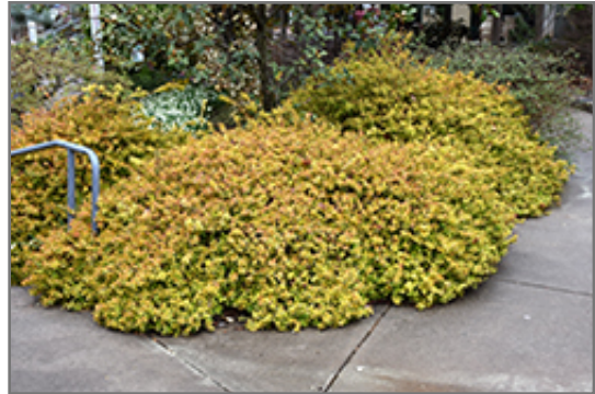
Kaleidoscope Abelia

Kaleidoscope Abelia will grow to be about 30 inches tall at maturity, with a spread of 4 feet. It tends to fill out right to the ground and therefore doesn't necessarily require facer plants in front. It grows at a slow rate, and under ideal conditions can be expected to live for approximately 30 years.