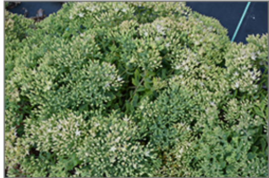
Thundercloud Stonecrop flower buds