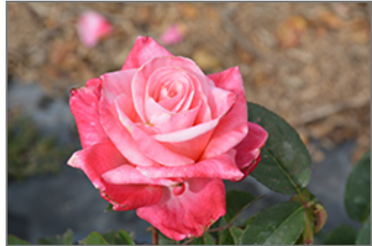
First Prize Rose flowers