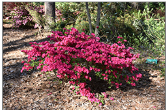
Girard's Fuchsia Evergreen Azalea in bloom