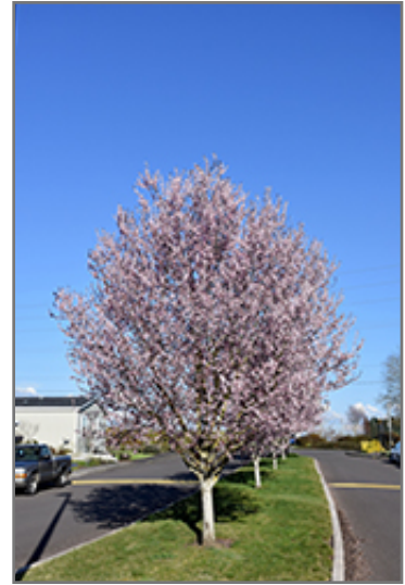
Krauter Vesuvius Plum in bloom

This tree will require occasional maintenance and upkeep, and is best pruned in late winter once the threat of extreme cold has passed. It is a good choice for attracting birds to your yard. Gardeners should be aware of the following characteristic(s) that may warrant special consideration;