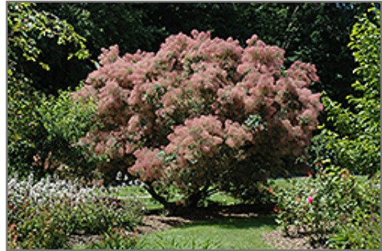
Grace Smokebush in bloom

This shrub will require occasional maintenance and upkeep, and is best pruned in late winter once the threat of extreme cold has passed. Deer don't particularly care for this plant and will usually leave it alone in favor of tastier treats. It has no significant negative characteristics.