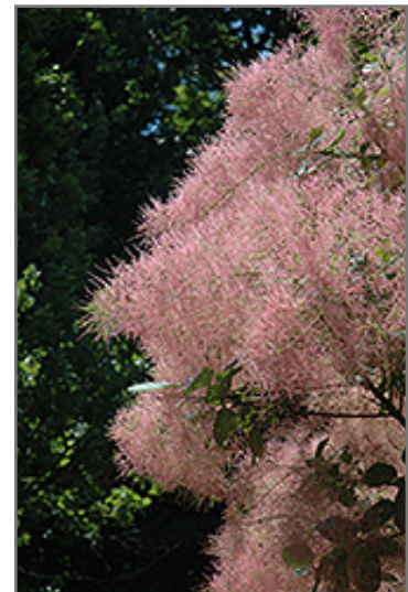
Grace Smokebush flowers