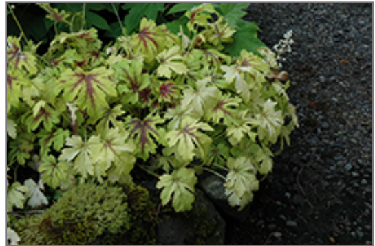
Golden Zebra Foamy Bells