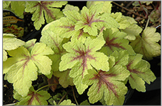
Golden Zebra Foamy Bells foliage

Golden Zebra Foamy Bells is recommended for the following landscape applications;