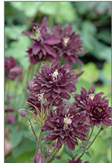
Clementine Dark Purple Columbine flowers