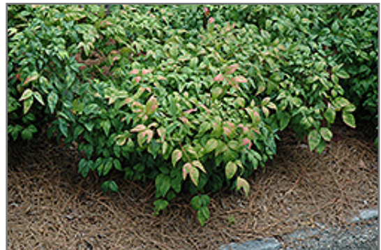
Fire Power Nandina