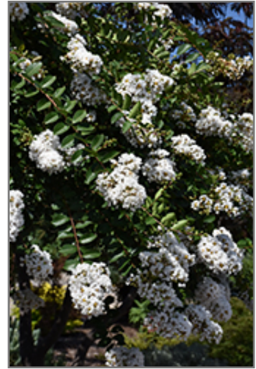
Acoma Crapemyrtle flowers

Acoma Crapemyrtle is recommended for the following landscape applications;