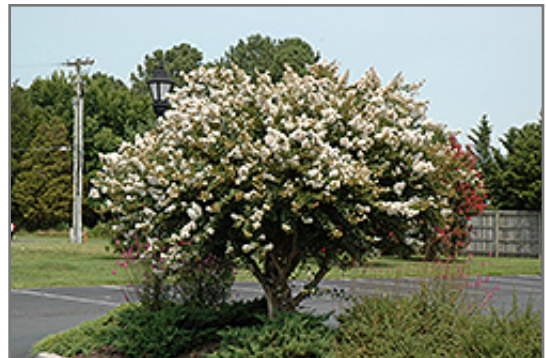
Acoma Crapemyrtle in bloom