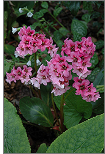
Pink Dragonfly Bergenia flowers