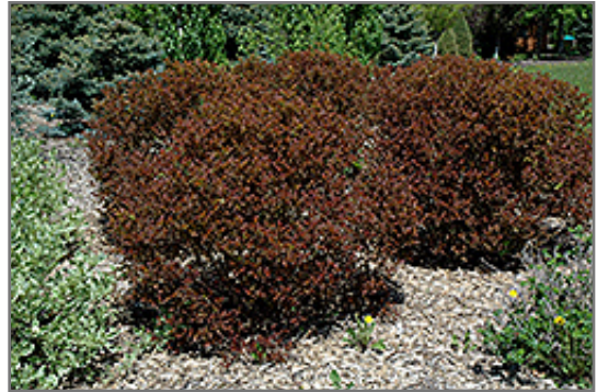
Summer Wine Ninebark

This shrub does best in full sun to partial shade. It is very adaptable to both dry and moist locations, and should do just fine under average home landscape conditions. It may require supplemental watering during periods of drought or extended heat. It is not particular as to soil type or pH. It is highly tolerant of urban pollution and will even thrive in inner city environments. This is a selection of a native North American species.