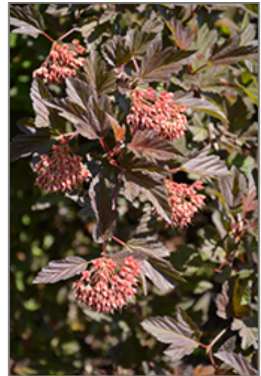
Summer Wine Ninebark flower buds