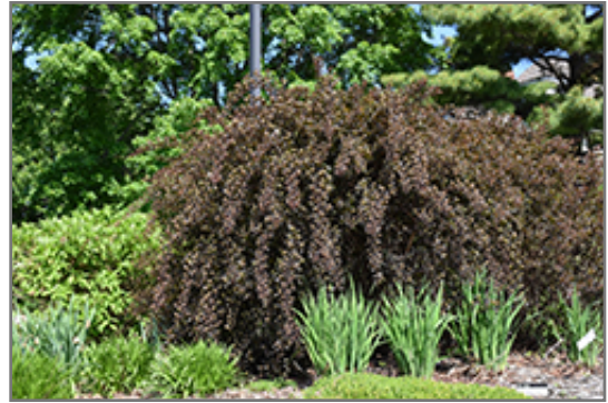
Summer Wine Ninebark

This shrub will require occasional maintenance and upkeep, and can be pruned at anytime. It has no significant negative characteristics.