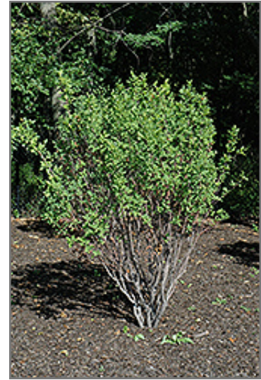
Rainbow Pillar Serviceberry

Rainbow Pillar Serviceberry is a dense multi-stemmed deciduous shrub with a narrowly upright and columnar growth habit. Its relatively fine texture sets it apart from other landscape plants with less refined foliage.