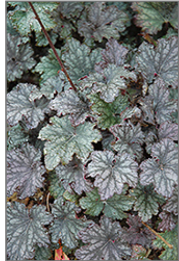
Frosted Violet Coral Bells foliage

This is a relatively low maintenance plant, and should be cut back in late fall in preparation for winter. It is a good choice for attracting hummingbirds to your yard. It has no significant negative characteristics.