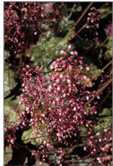
Frosted Violet Coral Bells flowers