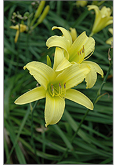
Hyperion Daylily flowers