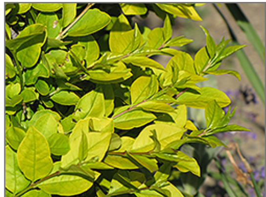
Golden Privet foliage