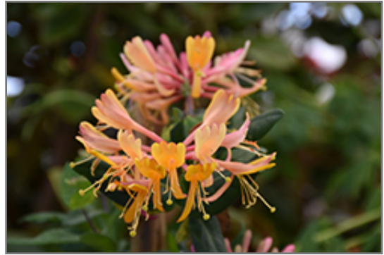
Goldflame Honeysuckle flowers