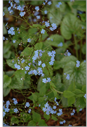
Alexander's Great Bugloss flowers