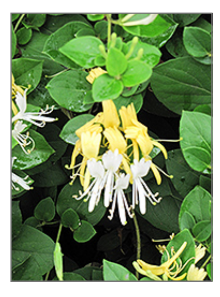
Hall's Japanese Honeysuckle flowers

Hall's Japanese Honeysuckle is recommended for the following landscape applications;