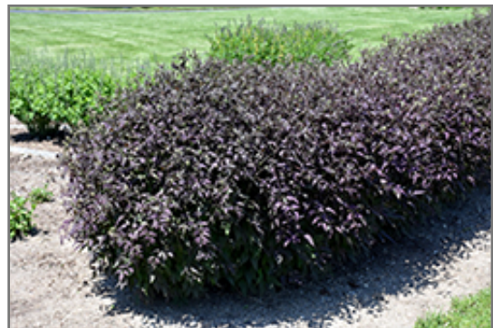
Serious Black Ground Clematis