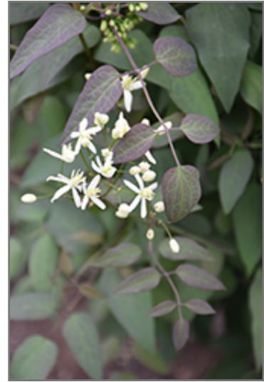
Serious Black Ground Clematis flowers

This plant does best in full sun to partial shade. It is very adaptable to both dry and moist growing conditions, but will not tolerate any standing water. It is not particular as to soil type or pH. It is highly tolerant of urban pollution and will even thrive in inner city environments. This is a selected variety of a species not originally from North America.