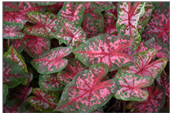
Carolyn Whorton Caladium foliage