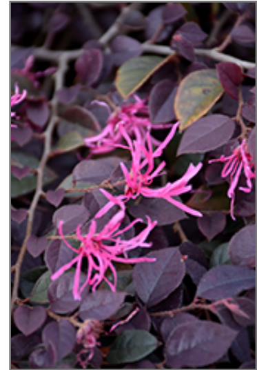
Crimson Fire Chinese Fringeflower flowers

Crimson Fire Chinese Fringeflower is recommended for the following landscape applications;