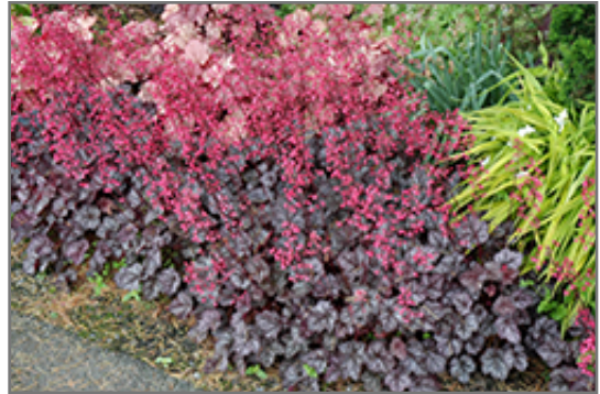
Glitter Coral Bells in bloom

This is a relatively low maintenance plant, and should be cut back in late fall in preparation for winter. It is a good choice for attracting hummingbirds to your yard. It has no significant negative characteristics.