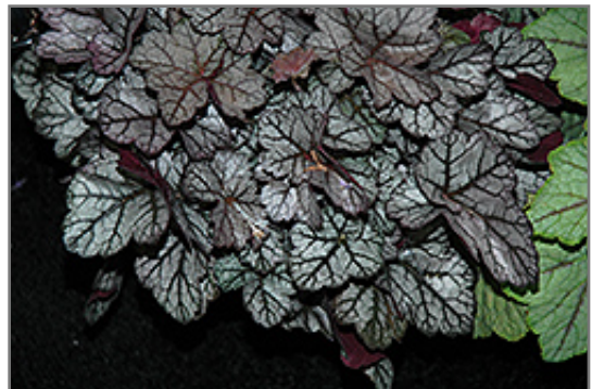
Glitter Coral Bells foliage