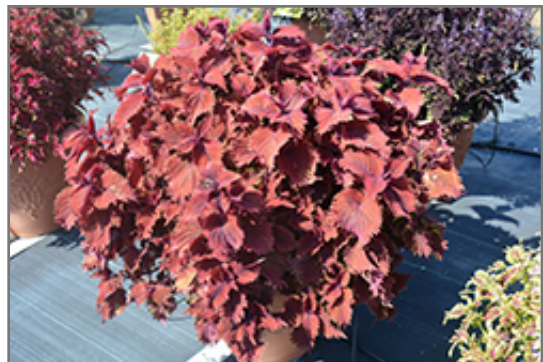
Under The Sea King Crab Coleus