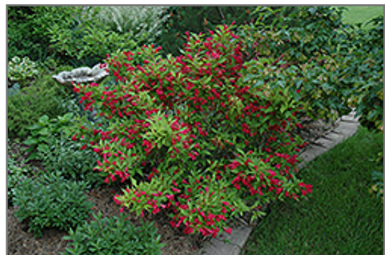
Red Prince Weigela in bloom