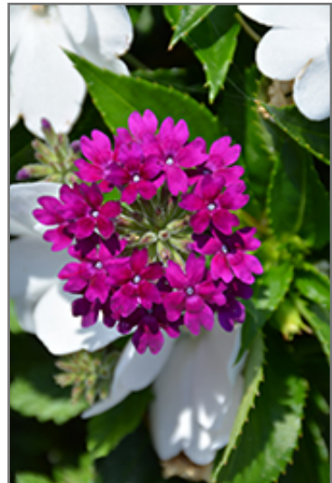
Superbena Royale Plum Wine Verbena flowers