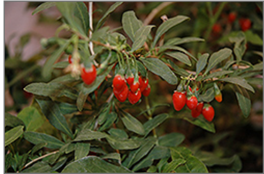
Big Lifeberry Goji Berry fruit

Aside from its primary use as an edible, Big Lifeberry Goji Berry is suitable for the following landscape applications;