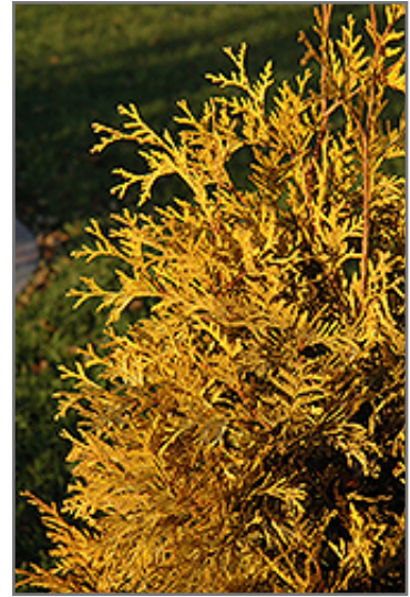
Yellow Ribbon Arborvitae in fall

This shrub does best in full sun to partial shade. It prefers to grow in average to moist conditions, and shouldn't be allowed to dry out. It may require supplemental watering during periods of drought or extended heat. It is not particular as to soil type or pH. It is somewhat tolerant of urban pollution, and will benefit from being planted in a relatively sheltered location. Consider applying a thick mulch around the root zone in winter to protect it in exposed locations or colder microclimates. This is a selection of a native North American species.