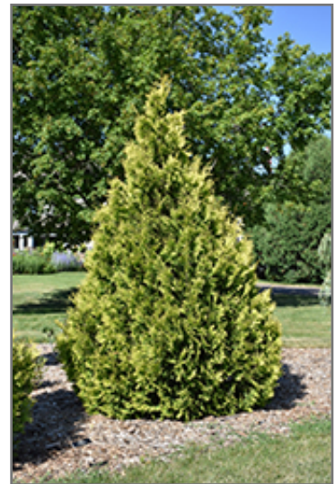
Yellow Ribbon Arborvitae