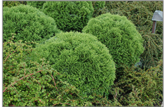
Little Giant Arborvitae