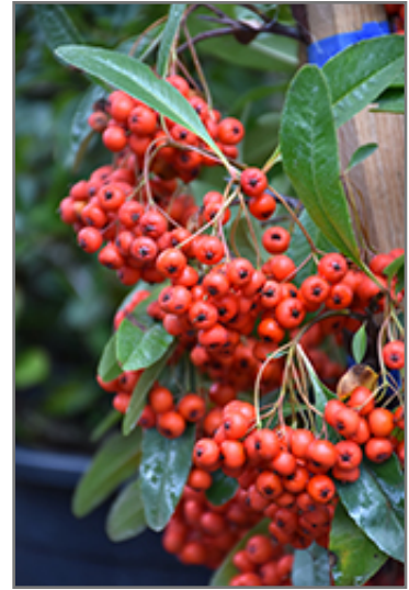
Victory Firethorn fruit