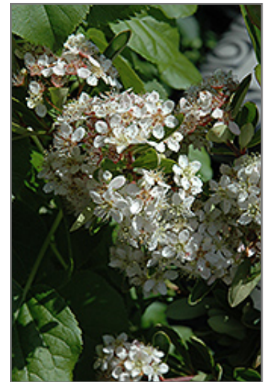
Victory Firethorn flowers