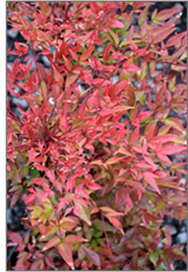
Obsession Nandina foliage