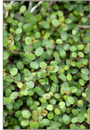
Creeping Wire Vine foliage