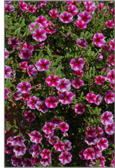
Can-Can Hot Pink Star Calibrachoa flowers

This plant will require occasional maintenance and upkeep. Trim off the flower heads after they fade and die to encourage more blooms late into the season. It is a good choice for attracting bees and hummingbirds to your yard, but is not particularly attractive to deer who tend to leave it alone in favor of tastier treats. It has no significant negative characteristics.