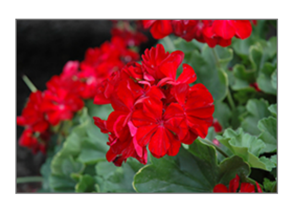
Calliope Dark Red Geranium flowers

Large flowers with stunning color; extremely well branched with a vigorous, mounding habit; ideal for large pots, containers, and landscape applications