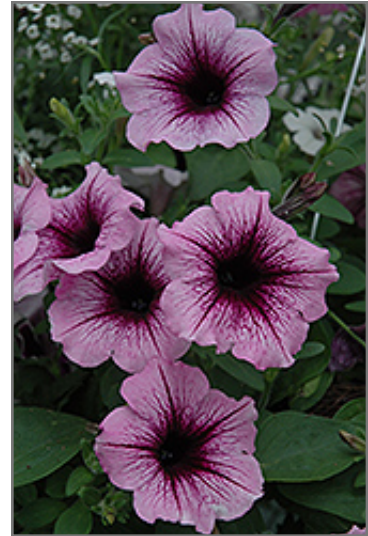
Supertunia Bordeaux Petunia flowers

Supertunia Bordeaux Petunia is recommended for the following landscape applications;