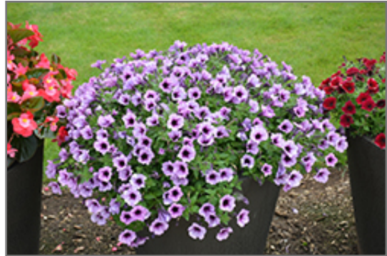
Supertunia Bordeaux Petunia in bloom

Supertunia Bordeaux Petunia will grow to be about 10 inches tall at maturity, with a spread of 24 inches. When grown in masses or used as a bedding plant, individual plants should be spaced approximately 20 inches apart. Its foliage tends to remain low and dense right to the ground. This fast-growing annual will normally live for one full growing season, needing replacement the following year.