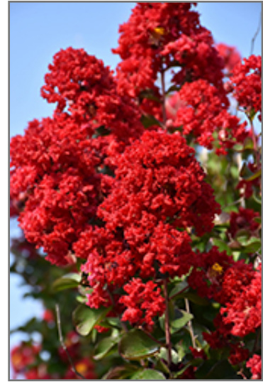
Dynamite Crapemyrtle flowers