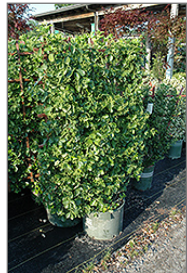
Manhattan Spreading Euonymus