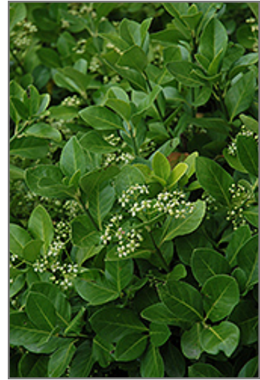
Manhattan Spreading Euonymus flowers

This shrub performs well in both full sun and full shade. It is very adaptable to both dry and moist locations, and should do just fine under average home landscape conditions. It may require supplemental watering during periods of drought or extended heat. It is not particular as to soil type or pH. It is highly tolerant of urban pollution and will even thrive in inner city environments, and will benefit from being planted in a relatively sheltered location. This is a selected variety of a species not originally from North America.