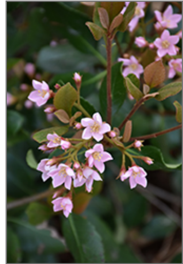
Pink Lady Indian Hawthorn flowers

Pink Lady Indian Hawthorn is recommended for the following landscape applications;